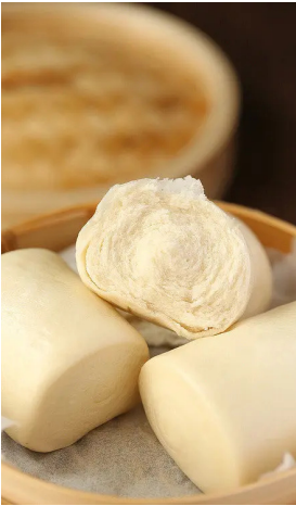
Steam bread 8-15 mins