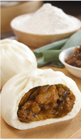
Meat bun 10-15 mins