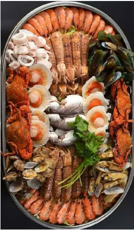
Seafood 8-10 mins