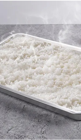
Rice 30-40 mins