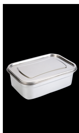
Lunch box 10 mins

Note: the above time is only for reference, and the specific time is subject to the experience of many tests in the actual steaming process. Set appropriate times for different products to keep the food at its best!