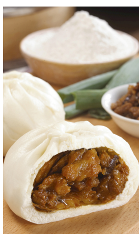
Meat bun 10-15 mins