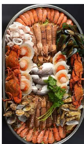
Seafood 8-10 mins