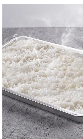
Rice 30-40 mins