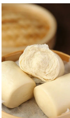
Steam bread 8-15 mins